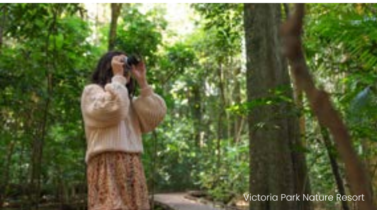
Victoria Park Nature Resort

Head back to the comfort of Ballina Beach Nature Resort for another night of relaxation where the kids can enjoy the waterpark.