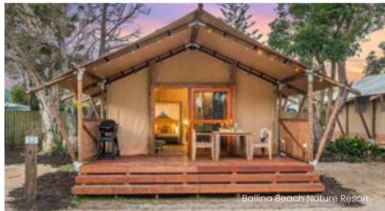
Ballina Beach Nature Resort