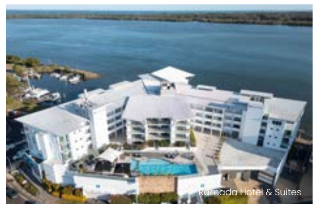
Ramada Hotel & Suites